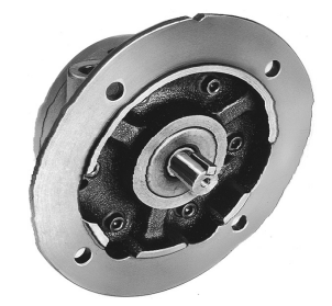
Model 2AM Shown