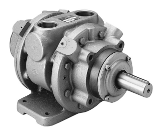
Model 16AM Shown

Thank you for purchasing this Gast product. It is manufactured to the highest standards using quality materials. This manual includes general safety instructions for operation under normal conditions and for operation in hazardous conditions. Please follow all recommended maintenance, operational and safety instructions and you will receive years of trouble-free service.