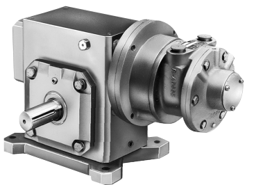
Model 6AM Shown