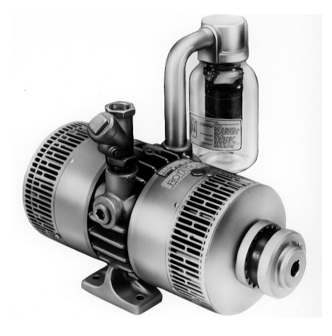
6066 B60 Model Shown