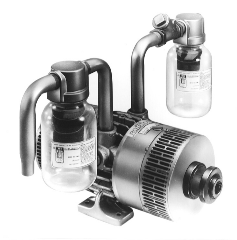
6066-V 103 Model Shown